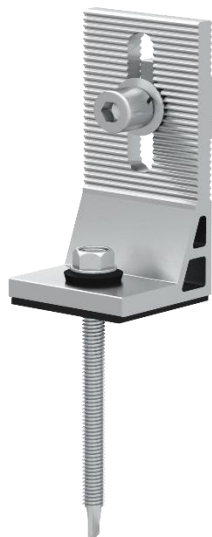
Tin Interface A with Carbon Steel Self-drilling Screw 6.3X85 for Metal Purlin and screw M8*25 Part No.: I-05A-6.3/85/CS-25