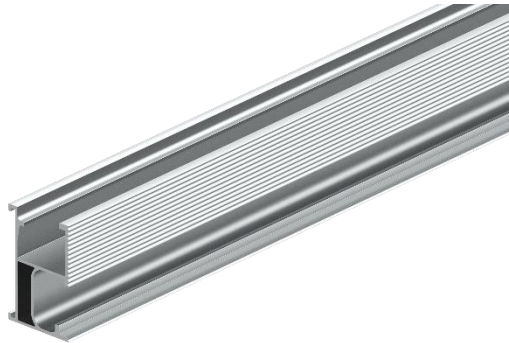
B50 Rail Part No.: ER-R-B50/XXXX